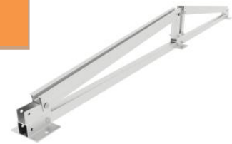
East-West Flat Roof Mount